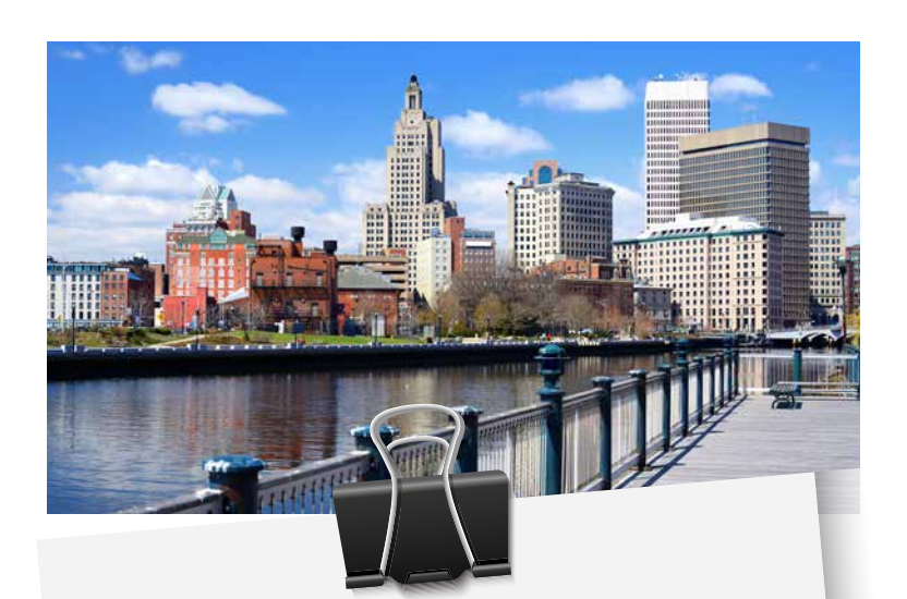
EXHIBIT SCHEDULE RHODE ISLAND CONVENTION CENTER